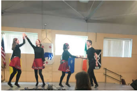
The Molly Malone Dancers