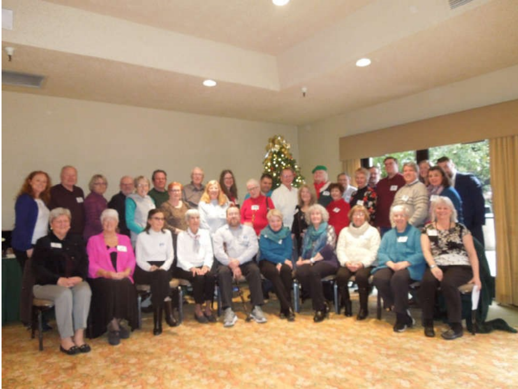
The gang's all here - where were you?