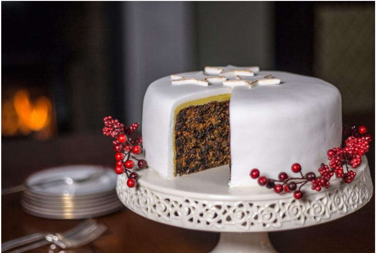
A Traditional Irish Christmas/Wedding Cake

can last for weeks or be gone in a matter of an afternoon. It was also the traditional wedding cake for our parents and grandparents. NOLLAIG SHONA DAOIBH.