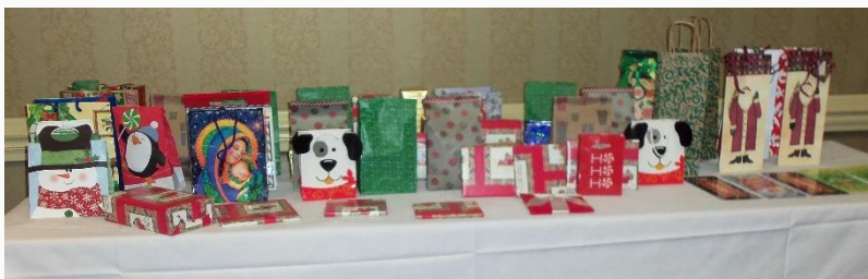
Assortment of AICS Christmas Gifts